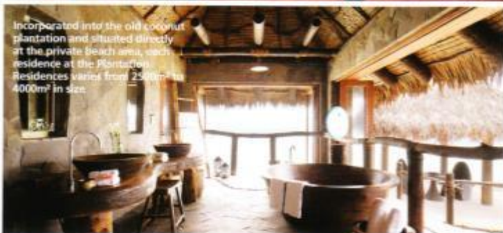
Incorporated into the old coconut plantation and situated directly at the private beach area, each residence at the Plantation Residences varies from 2500m 2 to 4000m 2 in size.